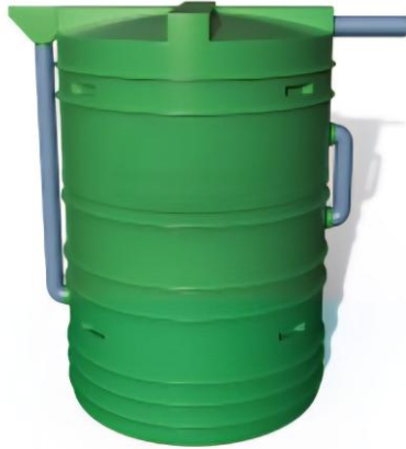
Biodigester / Biogas