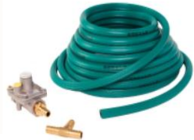
Pressure gauge and